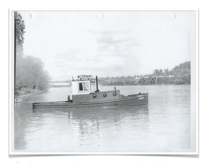
Like the LADY B, the tugs BILLY and LINCOLN, were similar to the many small boats that once worked the log rafts above and below The Falls.