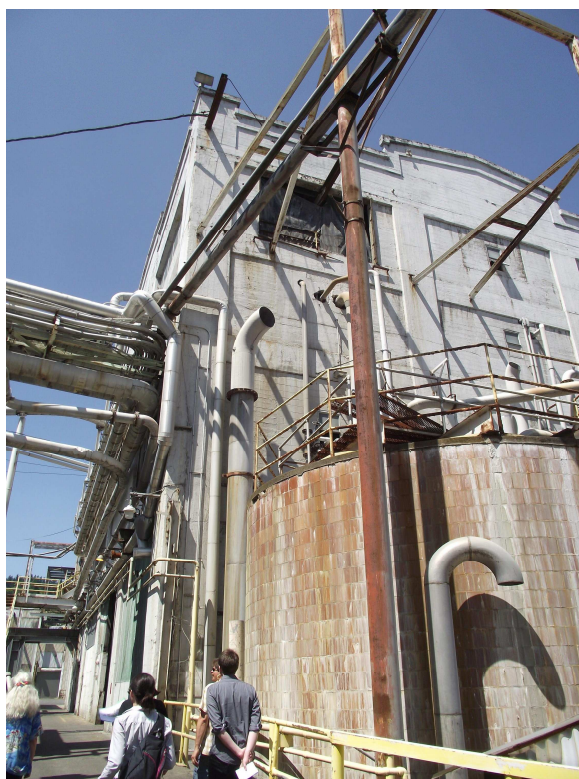
Preservationists representing several groups toured the closed Blue Heron paper mill with Oregon City planners and a Metro representative August 2, to inspect the historic resources on the property, which is on the auction block in December. The tour raised hopes for an ambitious adaptive reuse plan for the site.

Timing is everything, so the fact that the Corps still needs to do the costing and create a budget and work plan for the repairs before putting the request into its 2014 federal budget request looms as a huge threat to the businesses that work the river as well as potential recreational users of the Willamette River Water Trail. The public, which benefits from the locks being open and operational, supporting low local dredging bids for contracts at regional agencies such as the Port of Portland and the Corps itself, is urged to contact Oregon Congressional Delegation to support expediting the Corps' request and the repairs themselves.